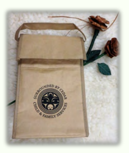
Lunch Kits $5.00