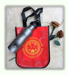
Totes & Water Bottles $5.00 $10.00

* Available at SCCFS by Cash or Cheque only