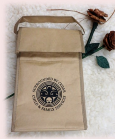
Lunch Kits $5.00