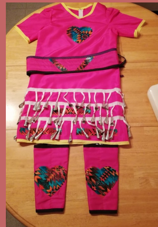
Photo: A traditional jingle dress made for a child from the Muskeg Lake Cree band. This child remembers having a jingle dress when she was very young and loving to dance in it, but it went missing after she had to move homes. Her social worker and cultural continuity worker joined together to find an artist to create her a new jingle dress. This dress was created by a Tsartlip First Nation artist to have traits of the child's personality embedded in the design, which can be seen in the bright pink fabric and heart appliques.