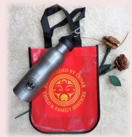
Totes & Water Bottles $5.00 $10.00